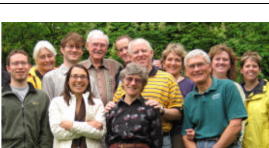
Directors and Advisors – 25 June 2007